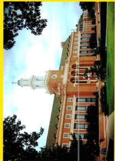
Oklahoma State University

“Hagan Scholar Testimonials” can be found on the HSF website, under the Scholarship Information Link.